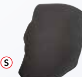
S Double Contour NIB-0573