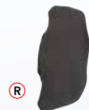
R Single Contour NIB-0574