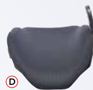
D Short Swing-Away Arm with Large Pad NLASS-NLPSL