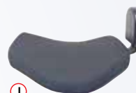
J Fixed Arm with Large Pad NKLAF-NLPL