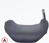
A Short Fixed Arm with Small Pad NLAFS-NLPHS