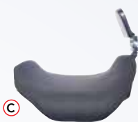
C Short Swing-Away Arm with Small Pad NLASS-NLPSS