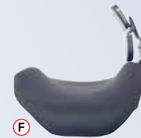
F Extendable Swing-Away Arm with Dual Small Pads NLASA-NLPTSS