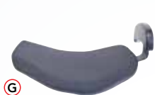
G Fixed Arm with Single Contoured Pad NKLAF-NLPCS