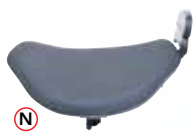
N Fixed Arm with Dual Contoured Pad NMAPS-LCS