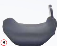
B Short Fixed Arm with Large Pad NLAFS-NLPHL