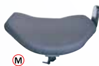
M Fixed Arm with Small Pad NMAPS-LPS