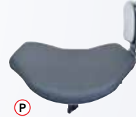
P Swing-Away Arm with Large Pad NMAPS-DLTSS