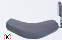
K Swing-Away Arm with Small Pad NKLAS-NLPSS