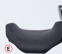
E Extendable Swing-Away Arm with Large Pads NLASA-NLPSL