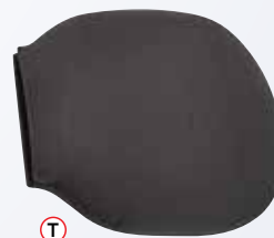
T Armadillo Large NIB-1413