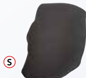
S Double Contour NIB-0573