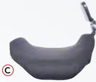
C Short Swing-Away Arm with Small Pad NLASS-NLPSS