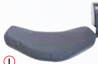
I Fixed Arm with Small Pad NKLAF-NLPS