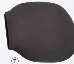
T Armadillo Large NIB-1413