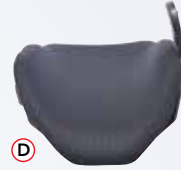
D Short Swing-Away Arm with Large Pad NLASS-NLPSL