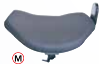
M Fixed Arm with Small Pad NMAPS-LPS