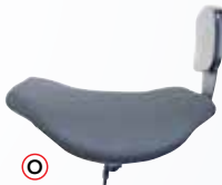
O Fixed Arm with Large Pad NMAPS-DLTSF