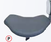
P Swing-Away Arm with Large Pad NMAPS-DLTSS