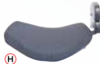
H Fixed Arm with Dual Contoured Pad NKLAF-NLPCD