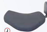
J Fixed Arm with Large Pad NKLAF-NLPL