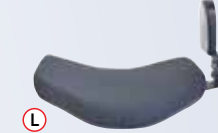
L Swing-Away Arm with Large Pad NKLAS-NLPSL