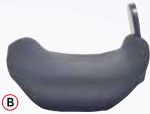
B Short Fixed Arm with Large Pad NLAFS-NLPHL