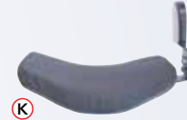
K Swing-Away Arm with Small Pad NKLAS-NLPSS