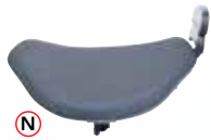
N Fixed Arm with Dual Contoured Pad NMAPS-LCS