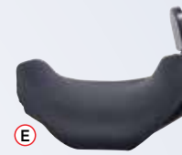
E Extendable Swing-Away Arm with Large Pads NLASA-NLPSL