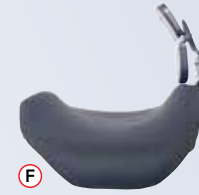
F Extendable Swing-Away Arm with Dual Small Pads NLASA-NLPTSS