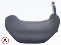
A Short Fixed Arm with Small Pad NLAFS-NLPHS