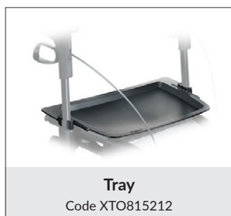
Tray Code XTO815212