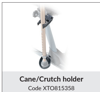
Cane/Crutch holder Code XTO815358