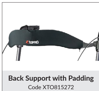
Back Support with Padding Code XTO815272