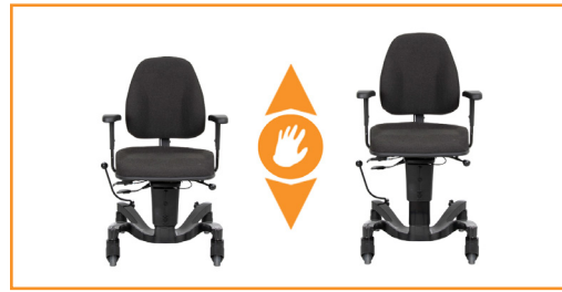
Manual / Gas lift: Vela Tango 700