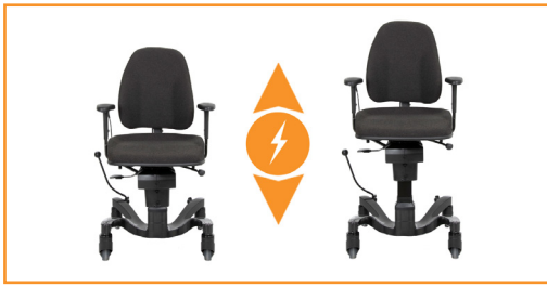
Electric: Vela Tango 700EL

The user's strength and energy levels during the day is a good indication to define how much help and support the user needs from the chair. You can choose between a manual (gas) lift, or electric lift.